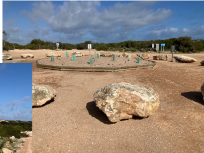
Above and left-Walkers Rock Campground

You will notice some changes at the Walkers Rock and Sheringa Beach campgrounds. A new section has opened at Sheringa Beach -Whiting Shoal. All campsites are now designated and have a site number allocated them. There are plenty of sites available while still helping to protect our beautiful environment. These sites can be booked on the Eyre Peninsula camping website: www.eyrepeninsula.com/camping . On the website there are overview maps showing the different sections within both campgrounds as well as maps showing the individual camp spots.