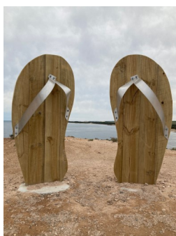
Thongs by Todd Romanowycz