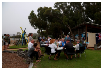
Australia Day 2022 breakfast being enjoyed by attendees.